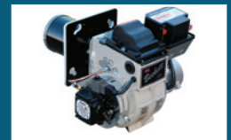
AFG Beckett burner