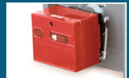
Riello F-40 Burner