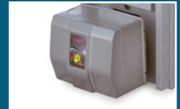
NX Beckett Burner