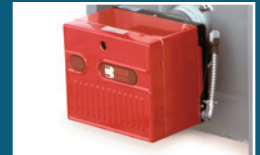
Riello F-40 Burner