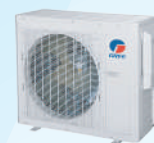
18K, 24K & 30K BTU/hr condensing units