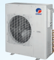
36K & 42K BTU/hr condensing units

GREE HVAC technology delivers superior comfort for all